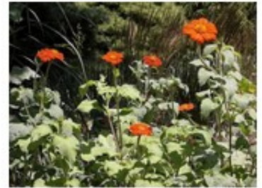
Form in bloom