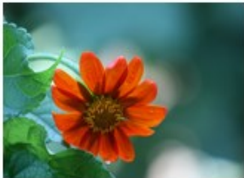
Flower Close-up (Johnston, NC)

Plant Tithonia rotundifolia in full sun in average, well-drained soils. Avoid rich soil or heavy fertilization, both of which promote excess foliage and weak stems. Pinch back plants to encourage sturdier, bushier growth. Sturdier plants are less likely to fall over but plants may need to be staked. Stems can be brittle, so shelter plants from strong winds if possible. Dead-head to prolong the bloom season.